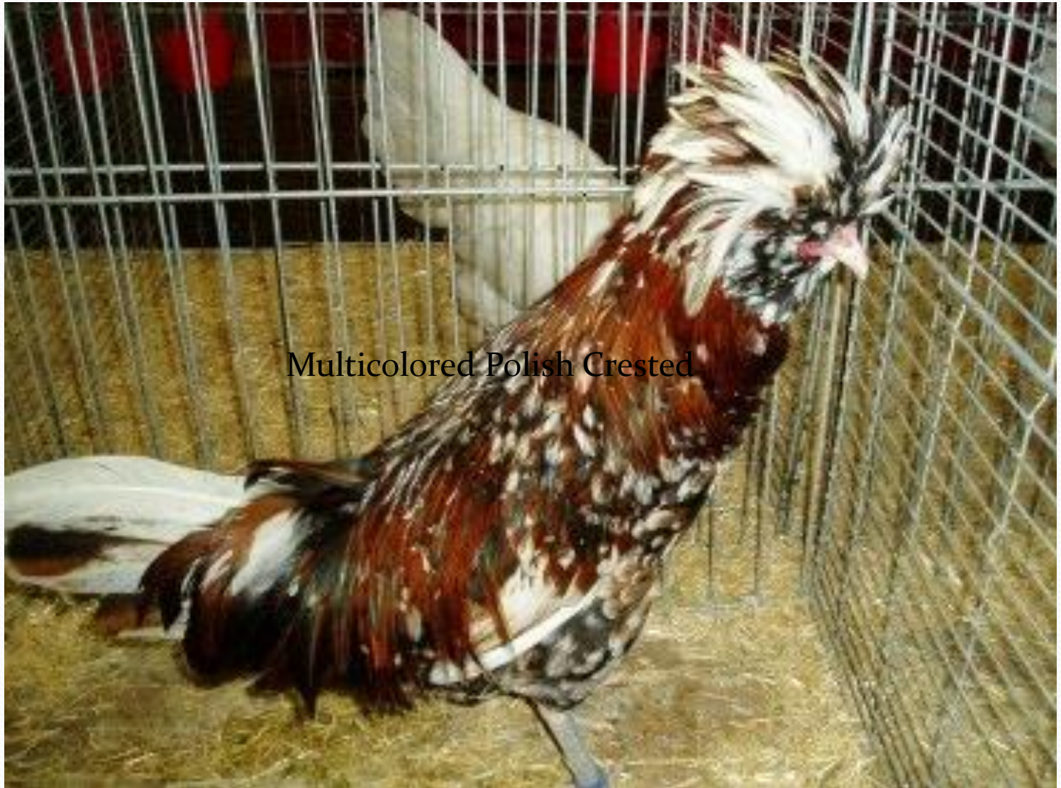
Multicolored Polish Crested