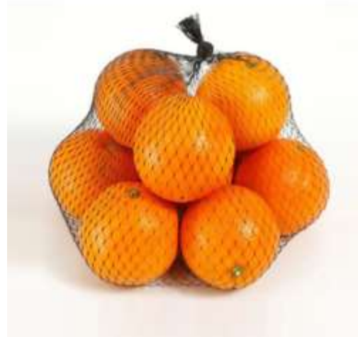
Different packages of fruits at retail market