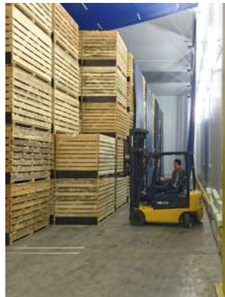
Careful unit handling to minimize impact bruises